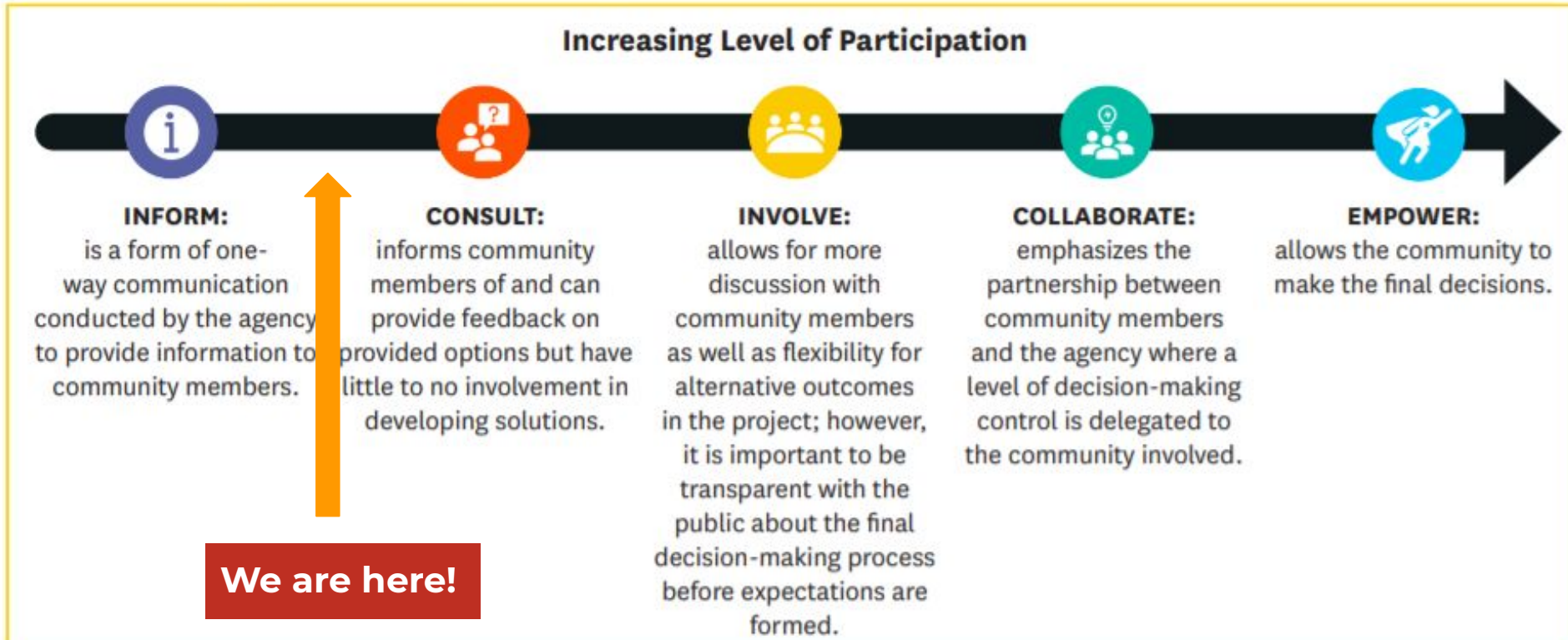
Chart 2: IAP2 Spectrum of Public Participation